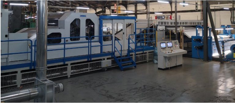
ANDRITZ batt forming line in operation at Romatex, Cape Town