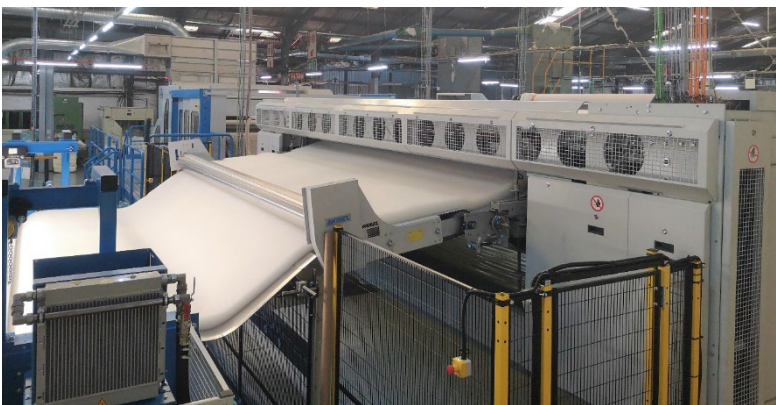
ANDRITZ crosslapper PRO 25-90