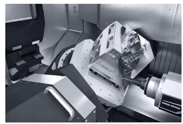
The swivel range of the INH 63 extends from + 45° to -195°. Its powerMASTER spindle has a speed of 12,000 rpm and 808 Nm of torque for heavy-duty cutting.

The wheel magazine, which has 63 tool positions as standard, can be expanded to six wheels, providing space for up to 363 tools. Tools weighing up to \emptyset 320 x 700 mm and 35 kg (optionally 50 kg) can be accommodated here. Starting with two wheels, full-time and part-time parallel setup is possible. The high mold capacities allow long autonomous operation when the INH 63 is integrated into large pallet storage solutions, for example. An optical mold breakage and chip control supports process-reliable production.