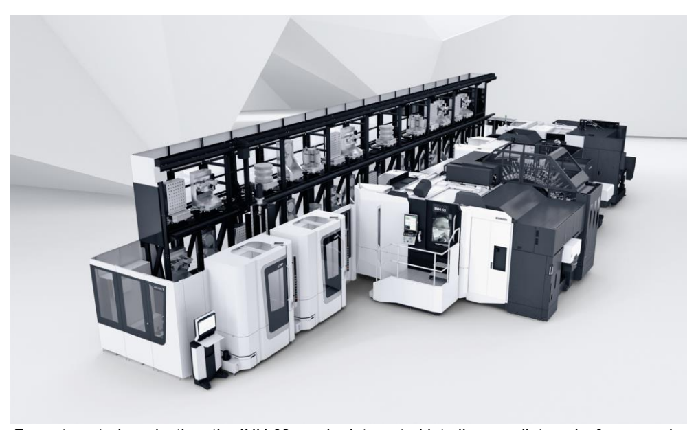
For automated production, the INH 63 can be integrated into linear pallet pools, for example.

The INH 63 can be used flexibly in automated production. Here, both linear pallet pools (LPP) and circular storage systems (CPP) are available, depending on the required number of pallet positions and the available production area. The hydraulic clamping pressure in the clamping devices is maintained by the pallet – even during pallet changes. In the future, DMG MORI will also enable workpiece handling using MATRIS or AMR.